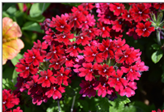
Superbena Royale Romance Verbena flowers

This plant will require occasional maintenance and upkeep. Trim off the flower heads after they fade and die to encourage more blooms late into the season. Deer don't particularly care for this plant and will usually leave it alone in favor of tastier treats. It has no significant negative characteristics.