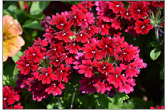
Superbena Royale Romance Verbena flowers

This plant will require occasional maintenance and upkeep. Trim off the flower heads after they fade and die to encourage more blooms late into the season. Deer don't particularly care for this plant and will usually leave it alone in favor of tastier treats. It has no significant negative characteristics.