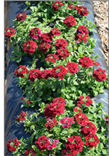
Superbena Royale Romance Verbena in bloom

Superbena Royale Romance Verbena is a fine choice for the garden, but it is also a good selection for planting in outdoor containers and hanging baskets. Because of its trailing habit of growth, it is ideally suited for use as a 'spiller' in the 'spiller-thriller-filler' container combination; plant it near the edges where it can spill gracefully over the pot. Note that when growing plants in outdoor containers and baskets, they may require more frequent waterings than they would in the yard or garden.