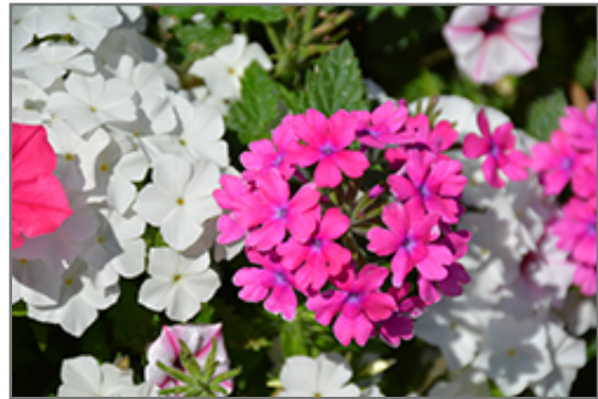
Superbena Pink Shades Verbena flowers

Superbena Pink Shades Verbena is recommended for the following landscape applications;