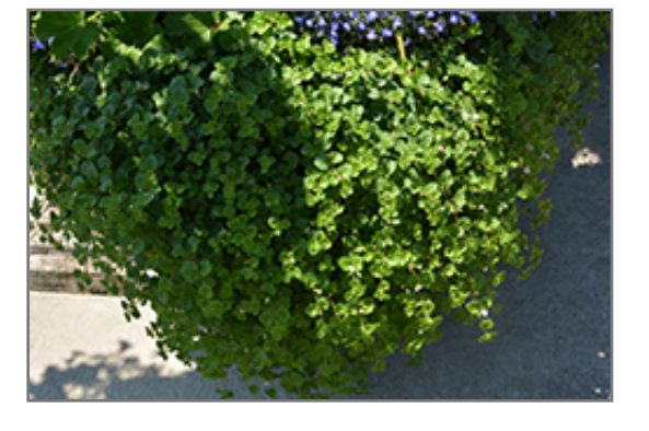
Snowstorm Blue Bubbles Bacopa foliage