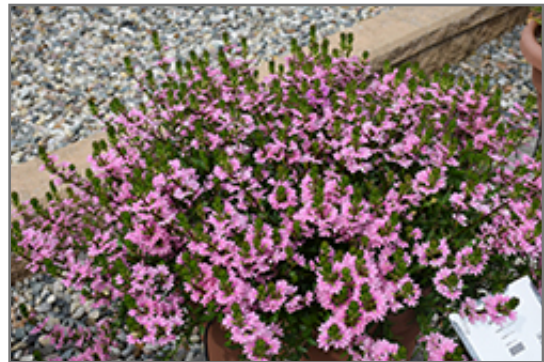
Whirlwind Pink Fan Flower in bloom