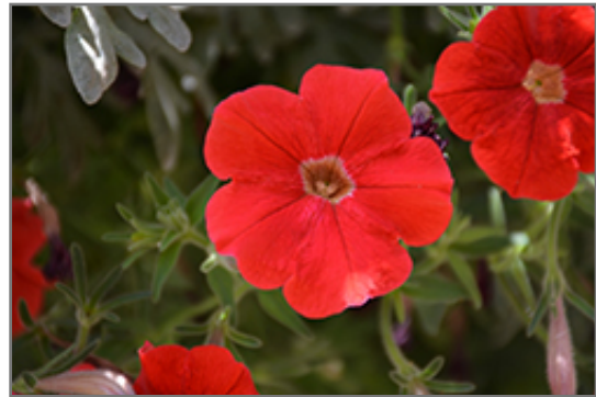
Supertunia Really Red Petunia flowers

This plant will require occasional maintenance and upkeep. Trim off the flower heads after they fade and die to encourage more blooms late into the season. It is a good choice for attracting butterflies and hummingbirds to your yard, but is not particularly attractive to deer who tend to leave it alone in favor of tastier treats. It has no significant negative characteristics.