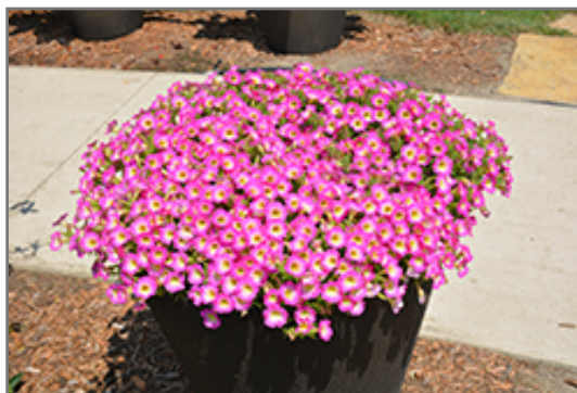
Supertunia Daybreak Charm Petunia in bloom

Supertunia Daybreak Charm Petunia is a fine choice for the garden, but it is also a good selection for planting in outdoor containers and hanging baskets. Because of its trailing habit of growth, it is ideally suited for use as a 'spiller' in the 'spiller-thriller-filler' container combination; plant it near the edges where it can spill gracefully over the pot. Note that when growing plants in outdoor containers and baskets, they may require more frequent waterings than they would in the yard or garden.