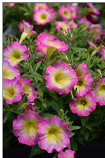
Supertunia Daybreak Charm Petunia flowers

Supertunia Daybreak Charm Petunia is a dense herbaceous annual with a trailing habit of growth, eventually spilling over the edges of hanging baskets and containers. Its medium texture blends into the garden, but can always be balanced by a couple of finer or coarser plants for an effective composition.