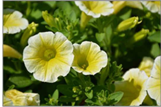
Blanket Yellow Petunia flowers

Blanket Yellow Petunia is recommended for the following landscape applications;