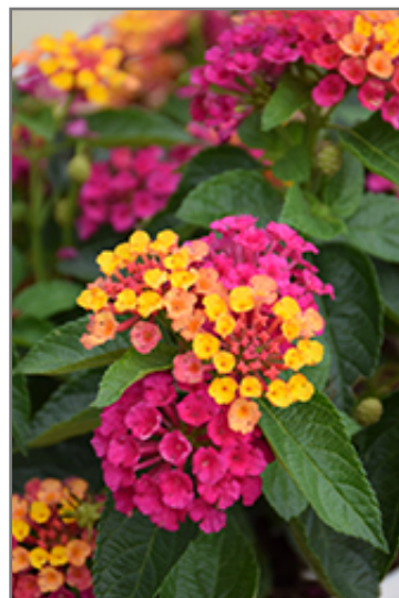
Luscious Royale Cosmo Lantana flowers

Luscious Royale Cosmo Lantana is recommended for the following landscape applications;