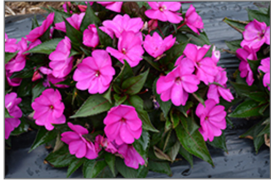
SunPatiens Compact Purple New Guinea Impatiens in bloom

SunPatiens Compact Purple New Guinea Impatiens is a fine choice for the garden, but it is also a good selection for planting in outdoor containers and hanging baskets. It can be used either as 'filler' or as a 'thriller' in the 'spiller-thriller-filler' container combination, depending on the height and form of the other plants used in the container planting. It is even sizeable enough that it can be grown alone in a suitable container. Note that when growing plants in outdoor containers and baskets, they may require more frequent waterings than they would in the yard or garden.