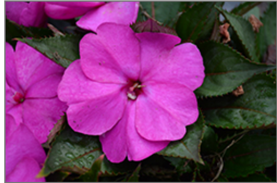
SunPatiens Compact Purple New Guinea Impatiens flowers

This plant will require occasional maintenance and upkeep, and should not require much pruning, except when necessary, such as to remove dieback. It has no significant negative characteristics.