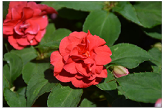
Rockapulco Red Impatiens flowers

Rockapulco Red Impatiens is recommended for the following landscape applications;