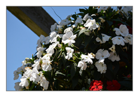
Infinity White New Guinea Impatiens flowers