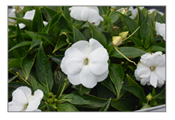
Infinity White New Guinea Impatiens flowers