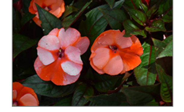
Infinity Orange Frost New Guinea Impatiens flowers