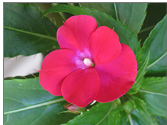
Infinity Cherry Red New Guinea Impatiens flowers