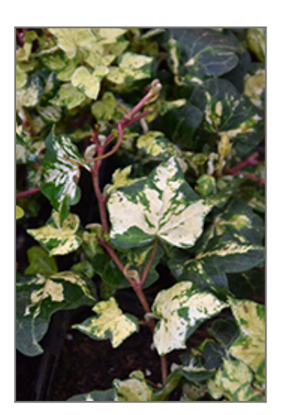
Golden Ingot Ivy foliage

When grown indoors, Golden Ingot Ivy can be expected to grow to be about 6 feet tall at maturity, with a spread of 16 inches. It grows at a medium rate, and under ideal conditions can be expected to live for approximately 30 years. This houseplant performs well in both bright or indirect sunlight and strong artificial light, and can therefore be situated in almost any well-lit room or location. It prefers to grow in average to moist soil. The surface of the soil shouldn't be allowed to dry out completely, and so you should expect to water this plant once and possibly even twice each week. Be aware that your particular watering schedule may vary depending on its location in the room, the pot size, plant size and other conditions; if in doubt, ask one of our experts in the store for advice. It is not particular as to soil pH, but grows best in rich soil. Contact the store for specific recommendations on pre-mixed potting soil for this plant. Be warned that parts of this plant are known to be toxic to humans and animals, so special care should be exercised if growing it around children and pets.