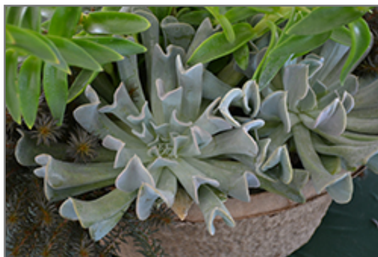
Topsy Turvy Echeveria

This is a dense herbaceous evergreen houseplant with tall flower stalks held atop a low mound of foliage. Its relatively fine texture sets it apart from other indoor plants with less refined foliage. This plant should not require much pruning, except when necessary to keep it looking its best.