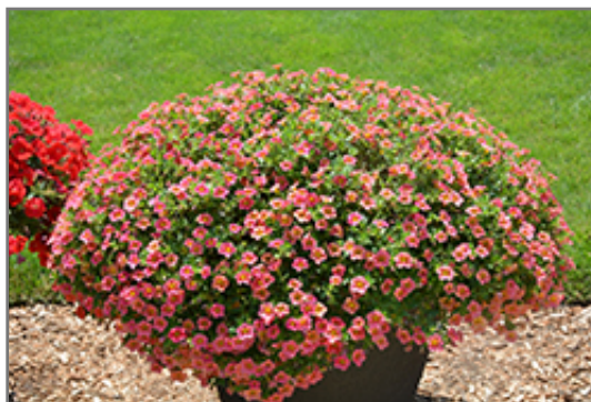
Superbells Tropical Sunrise Calibrachoa in bloom