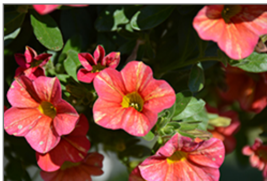
Superbells Tropical Sunrise Calibrachoa flowers

Superbells Tropical Sunrise Calibrachoa is a dense herbaceous annual with a trailing habit of growth, eventually spilling over the edges of hanging baskets and containers. Its medium texture blends into the garden, but can always be balanced by a couple of finer or coarser plants for an effective composition.