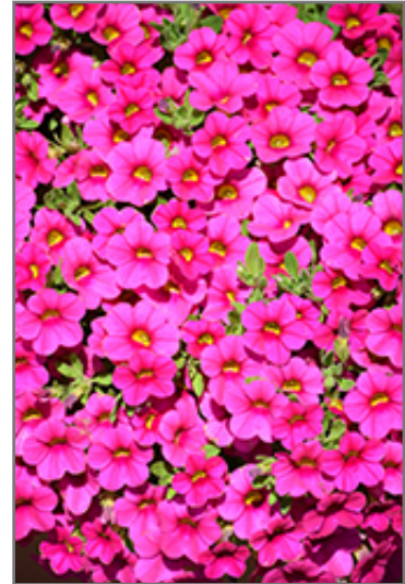
Million Bells Compact Brilliant Pink Calibrachoa flowers

This plant will require occasional maintenance and upkeep. Trim off the flower heads after they fade and die to encourage more blooms late into the season. It is a good choice for attracting bees and hummingbirds to your yard, but is not particularly attractive to deer who tend to leave it alone in favor of tastier treats. It has no significant negative characteristics.