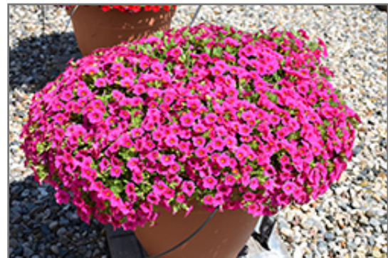
Million Bells Compact Brilliant Pink Calibrachoa in bloom