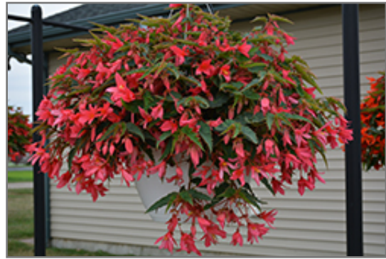
Bossa Nova Pink Glow Begonia in bloom

Bossa Nova Pink Glow Begonia is a fine choice for the garden, but it is also a good selection for planting in outdoor containers and hanging baskets. Because of its trailing habit of growth, it is ideally suited for use as a 'spiller' in the 'spiller-thriller-filler' container combination; plant it near the edges where it can spill gracefully over the pot. Note that when growing plants in outdoor containers and baskets, they may require more frequent waterings than they would in the yard or garden.