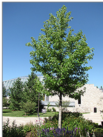
Sweet Gum

This tree should only be grown in full sunlight. It prefers to grow in average to moist conditions, and shouldn't be allowed to dry out. It may require supplemental watering during periods of drought or extended heat. It is very fussy about its soil conditions and must have rich, acidic soils to ensure success, and is subject to chlorosis (yellowing) of the foliage in alkaline soils. It is somewhat tolerant of urban pollution. This species is native to parts of North America.