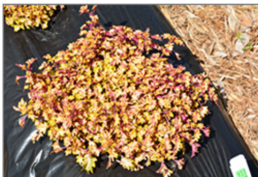
Wildfire Flash Coleus