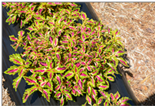
Terra Nova Jitters Coleus