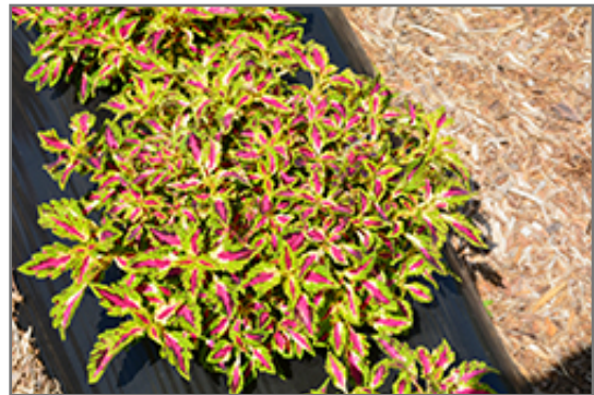
Terra Nova Jitters Coleus