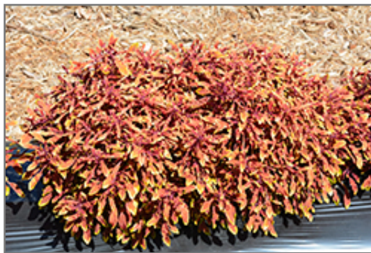
Hipsters Jasper Coleus