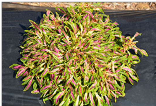
Fancy Feathers Pink Coleus