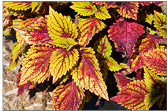
Color Clouds Hottie Coleus foliage

Color Clouds Hottie Coleus is recommended for the following landscape applications;