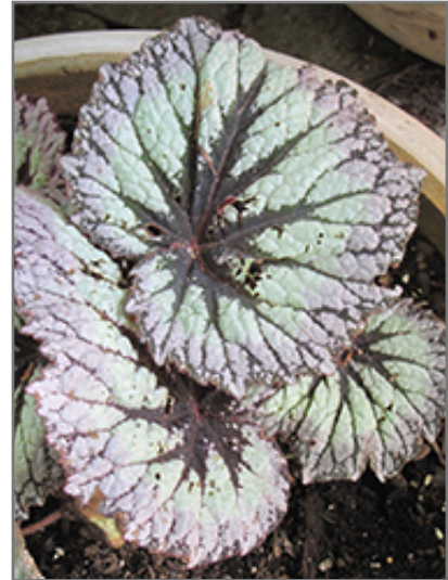
Fireworks Begonia foliage

An outstanding begonia with striking silver-white leaves with rosy edges, and deep burgundy veins for a visual impact in the garden; pink blooms add to the appeal; upright habit; an attractive indoor accent plant