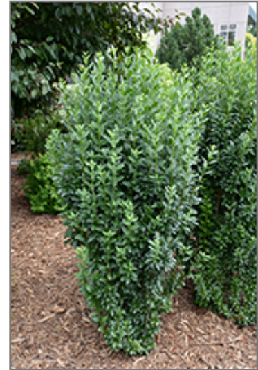
Straight Talk Privet