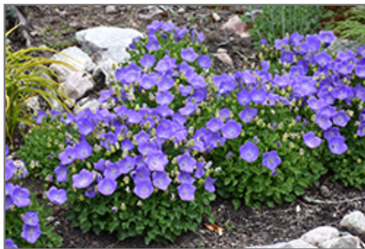
Rapido Blue Bellflower in bloom