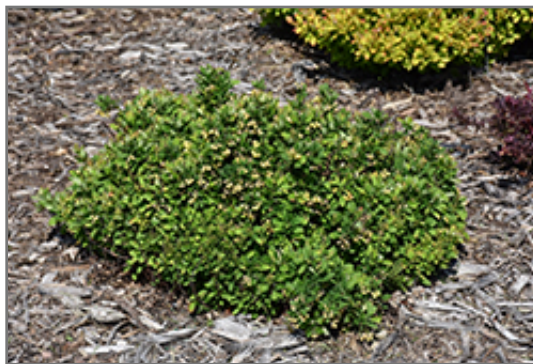
Moscato Barberry