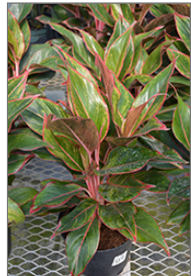
Siam Aurora Chinese Evergreen in full