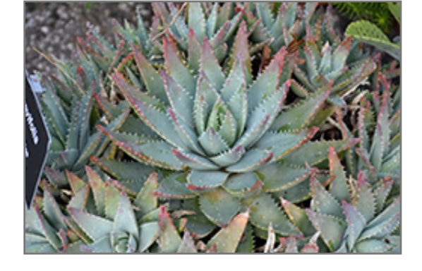
Short-leaved Aloe

Landscape Services & Design Center 1190 W. Moana Lane Reno, NV 89509 (775) 825-0602 ext. 134 NV Lic. #3379A, D & CA Lic. #317448