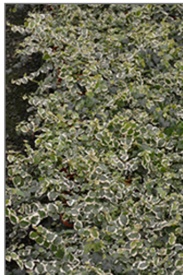
Variegated Creeping Fig in full