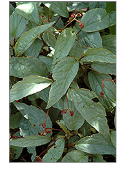
Silver Begonia foliage