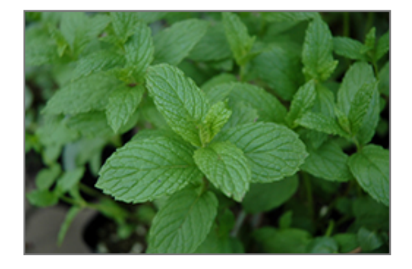
The Best Spearmint foliage