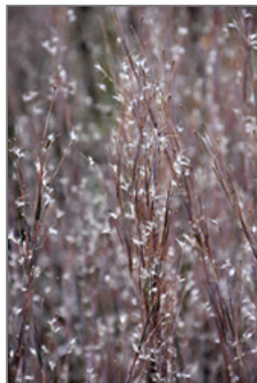
Standing Ovation Bluestem fruit

This plant should only be grown in full sunlight. It is very adaptable to both dry and moist locations, and should do just fine under typical garden conditions. It is considered to be drought-tolerant, and thus makes an ideal choice for a low-water garden or xeriscape application. It is not particular as to soil type or pH. It is somewhat tolerant of urban pollution. This is a selection of a native North American species. It can be propagated by division; however, as a cultivated variety, be aware that it may be subject to certain restrictions or prohibitions on propagation.