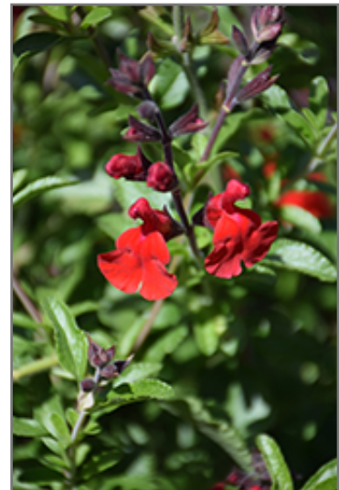
Radio Red Autumn Sage flowers

Moana Lane Garden Center & Corporate Office 1100 W. Moana Lane Reno, NV 89509 (775) 825-0600 (775) 825-0602 - Corporate Office