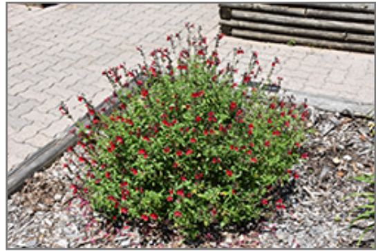
Radio Red Autumn Sage in bloom