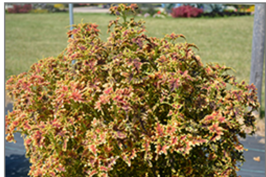
Under The Sea Copper Coral Coleus