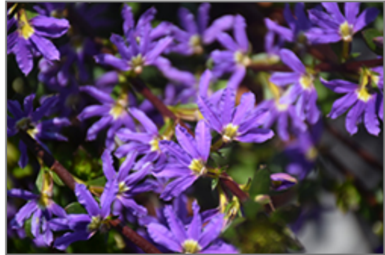
Paper Doll Top Model Fan Flower flowers