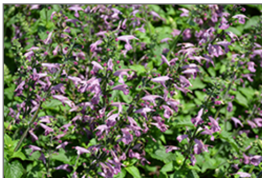
Summer Jewel Lavender Sage flowers

Summer Jewel Lavender Sage is recommended for the following landscape applications;