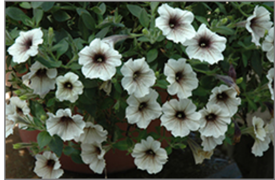
Supertunia Latte Petunia flowers