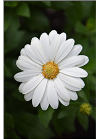
Akila Daisy White African Daisy flowers

Akila Daisy White African Daisy is recommended for the following landscape applications;