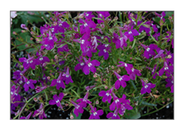
Waterfall Purple Lobelia flowers