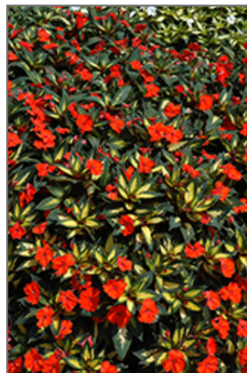
SunPatiens Spreading Tropical Orange New Guinea Impatiens flowers

SunPatiens Spreading Tropical Orange New Guinea Impatiens is a fine choice for the garden, but it is also a good selection for planting in outdoor containers and hanging baskets. It can be used either as 'filler' or as a 'thriller' in the 'spiller-thriller-filler' container combination, depending on the height and form of the other plants used in the container planting. It is even sizeable enough that it can be grown alone in a suitable container. Note that when growing plants in outdoor containers and baskets, they may require more frequent waterings than they would in the yard or garden.