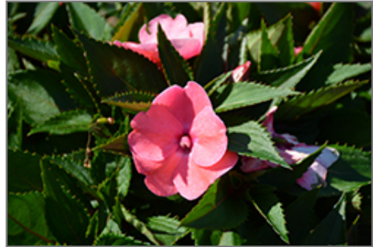
SunPatens Spreading Shell Pink New Guinea Impatiens flowers

SunPatens Spreading Shell Pink New Guinea Impatiens is recommended for the following landscape applications;