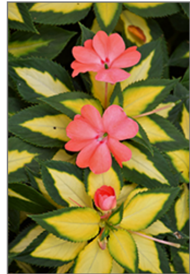
SunPatiens Spreading Salmon New Guinea Impatiens flowers

This plant will require occasional maintenance and upkeep, and should not require much pruning, except when necessary, such as to remove dieback. It is a good choice for attracting bees and butterflies to your yard. It has no significant negative characteristics.