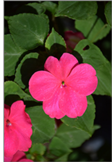
Lollipop Fruit Punch Rose Impatiens flowers