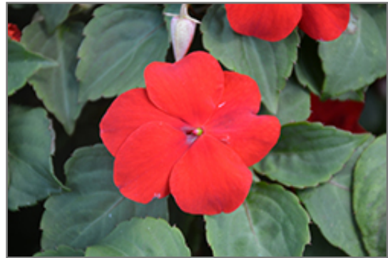
Lollipop Cherry Red Impatiens flowers