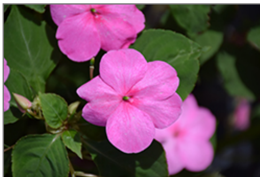
Lollipop Bubblegum Pink Impatiens flowers

Lollipop Bubblegum Pink Impatiens is recommended for the following landscape applications;