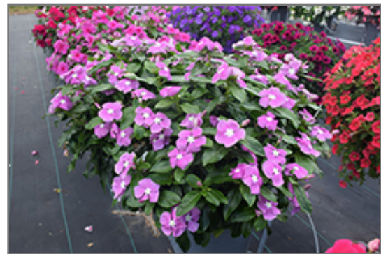
Valiant Orchid Vinca in bloom