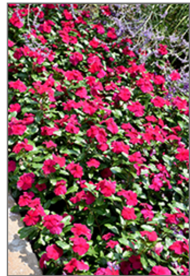
Valiant Burgundy Vinca flowers