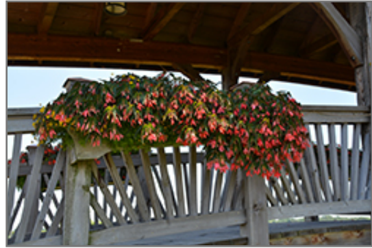
San Francisco Begonia in bloom

San Francisco Begonia is a fine choice for the garden, but it is also a good selection for planting in outdoor containers and hanging baskets. Because of its trailing habit of growth, it is ideally suited for use as a 'spiller' in the 'spiller-thriller-filler' container combination; plant it near the edges where it can spill gracefully over the pot. Note that when growing plants in outdoor containers and baskets, they may require more frequent waterings than they would in the yard or garden.