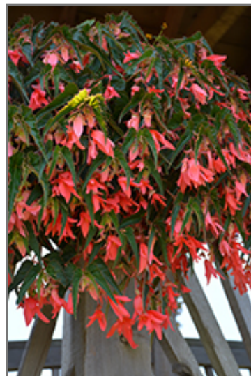
San Francisco Begonia in bloom