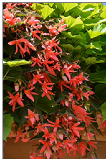
San Francisco Begonia flowers